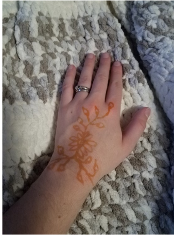
After 1 day