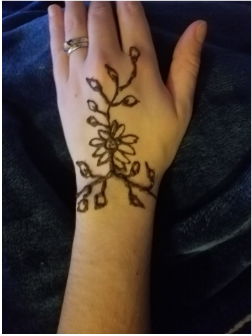
Just after application