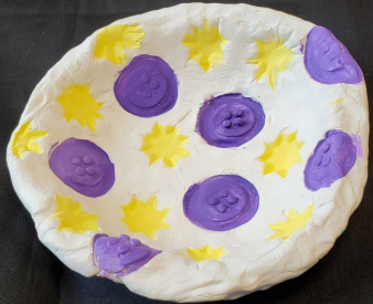
Stamped Key Dish