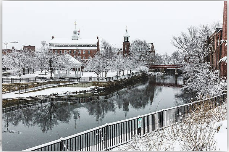
A view of the Belknap Mill and the river after a winter storm