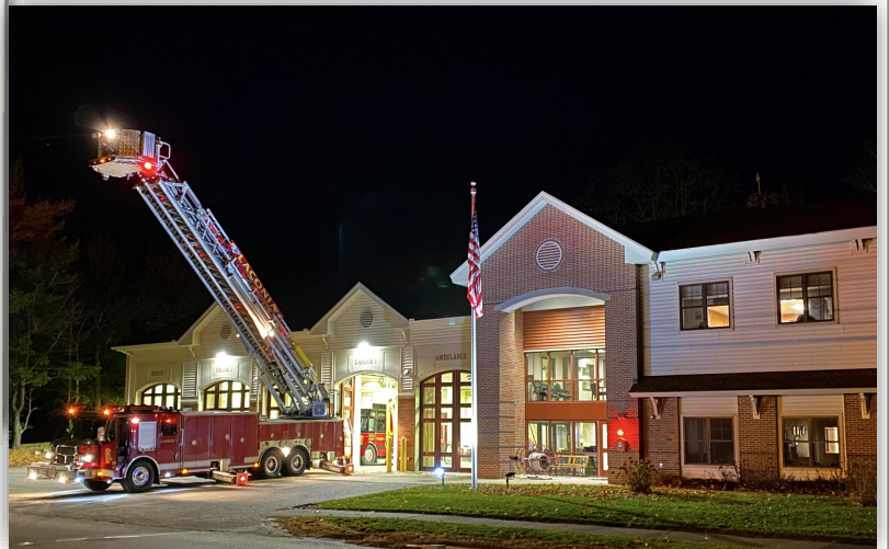
Photo of the Laconia Fire Station