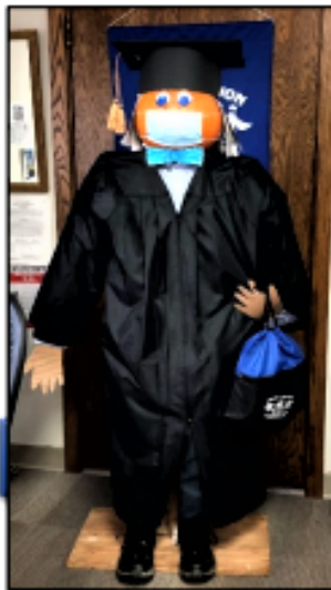
Introducing LRSF figure BRAD THE GRAD

Lakes Region Scholarship Foundation invites members of the Lakes Region Community to enter our 1 st Annual Pumpkin Figure Contest. Build your own unique pumpkin figures as an individual, family, school, organization or business group. The figures must include at least one pumpkin along with other recycled or other creative parts. Use your imagination and come up with something unique, sweet or even scary. Perhaps something that fits a business or a hobby, for example: a set of pumpkin figures might be exercising, if a gym enters; or group might choose to create a character or perhaps a set of characters from their favorite movie. The creations could be as simple as a scarecrow with a pumpkin head or a snowman made of pumpkins.