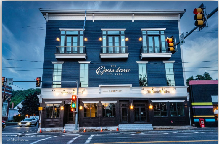
The newly renovated Opera House in Lakeport