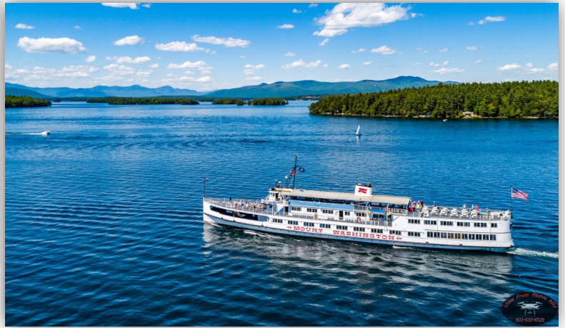
The Mount Washington taking in the sights on Lake Winnepesaukee