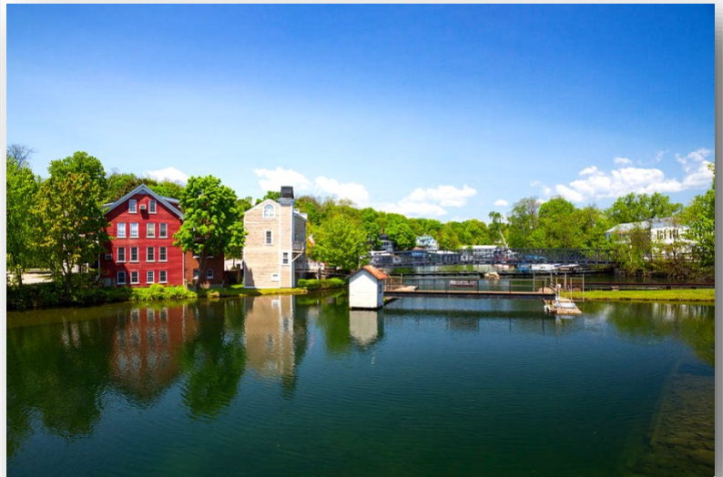
Lakeport Dam