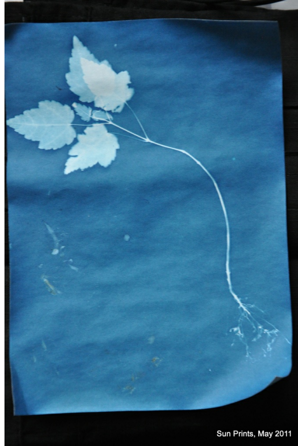
Sun Prints, May 2011