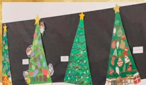
Exhibit open to the public: Mon.-Fri., 9am-5pm; Sat., 9 am-4 pm

A twist on a Festival of Trees this exhibit features the creative talents of local amateur artists tasked with decorating a cut out tree shape with only one restriction..."be creative, anything goes!" Children and adults from Holy Trinity Pre-School, Lakes Region Childcare Services, Acton Academy, Taylor Community, Spaulding Youth Center, Woodland Heights Elementary School, Laconia High School, Belknap County 4H SPIN students, the Laconia Senior Center and young visitors to our Yuletide Traditions event have taken the given task to heart!