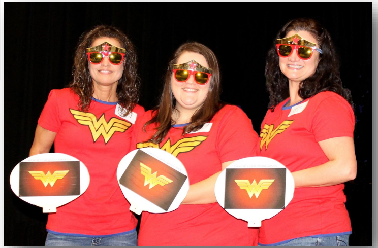
"Wescott Law Wonder Women" shown at this year's 19th Annual Spelling Bee! More photos on pg 16...