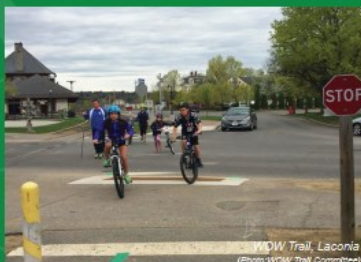
Wow Trail, Laconia