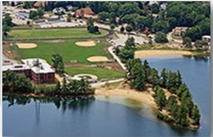
Aerial View of Opechee