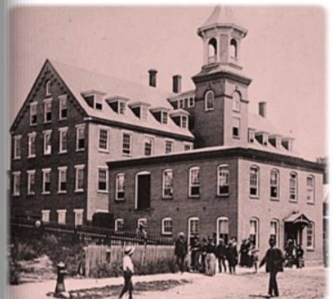
The original mill in the late 1890's