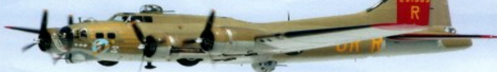
B-17 FLYING FORTRESS