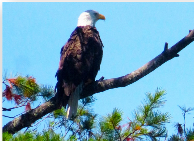
Eagle seen recently near Ahern State Park