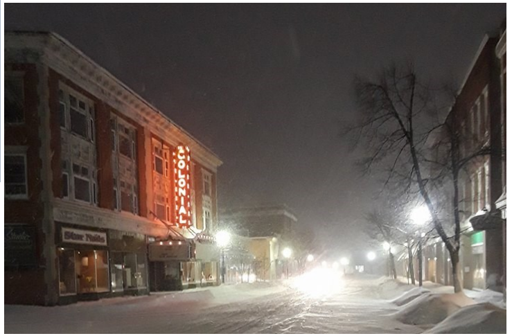
Lights of the Colonial Theater on a snowy winter night