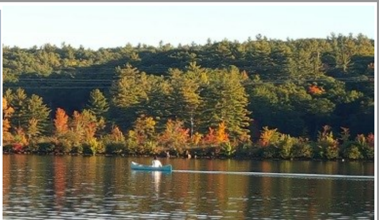
Autumn on Lake Winnisquam