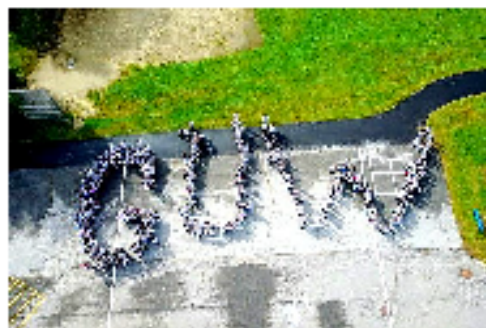
Pictured : Pleasant Streets School's student, staff, and volunteer formation of GUW for Granite United Way's Day of Caring on Thursday, September 7 th .