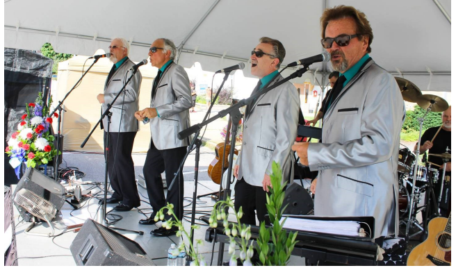
The Rockin' Daddios at the Laconia Passenger Station 125th Anniversary Celebration (more photos page six )