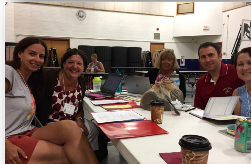
Our Laconia Team at the Performance Assessment of Competency Education (PACE) Conference in Concord on Wednesday, August 16th.