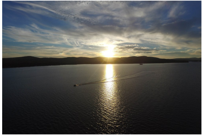
Sunset on Lake Winnisquam