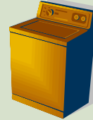
Washers & Dryers