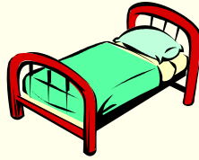
Mattresses & Box Springs