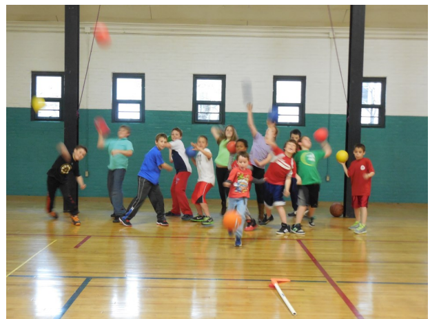
The last kids to play on the old gym floor!!!!

Come have some fun playing all different types of games and arts and crafts. Parents may drop kids off to play.