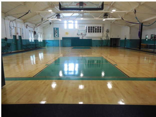
New gym floor!!!