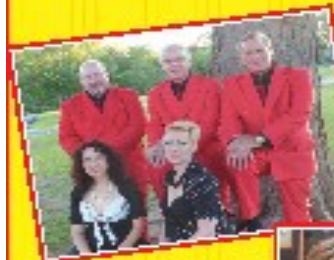
Songs and Stories from 60's British Pop Star Julie Grant

1950's & 60's Doo Wop and... BRITISH POP