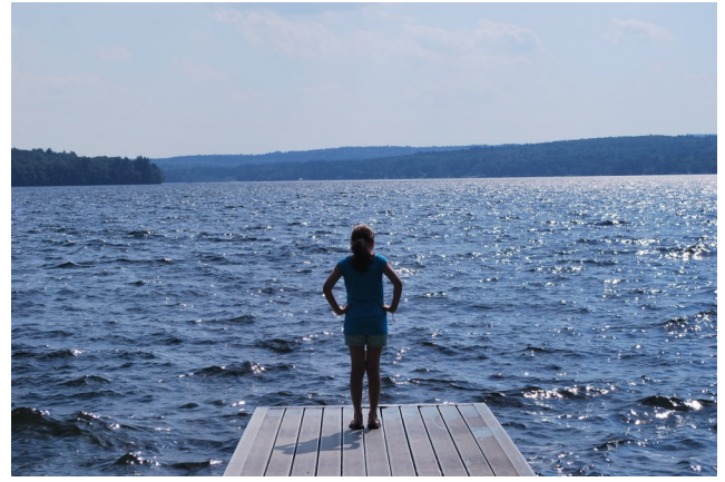
Daydreaming at Gale Avenue Docks