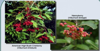
April 2012: We sited four bluebirds in mid-February, suggesting our brood returned or wintered here. More community volunteers will get involved this April with WM and the City to plant native high bush cranberry and nannyberry as fall/winter food supply for our bluebirds and other species.