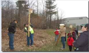
April 2011: Belmont students constructed ten bluebird boxes, which were mounted around the site with the assistance of Waste Management and the City of Laconia.