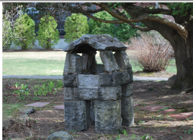
Gale Library Garden Feature