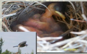
July 12, 2011: Four baby bluebirds hatched over the weekend, born naked and with their eyes closed. Mom and Dad worked hard to keep them fed.