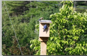
June 2011: WM employees sited our first pair of bluebirds, who showed great interest in Box #5. The pair quickly got to work building a nest. Four eggs were observed in late June!