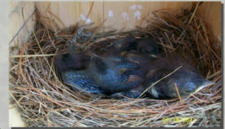
July 19, 2011: The four fledglings are growing fast and are partially feathered. They flew away a little more than a week later.