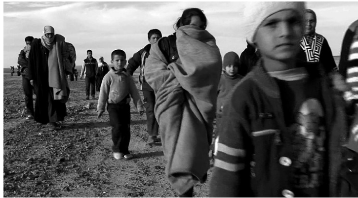
A scene from "A Requiem for Syrian Refugees."

~ Movie showing: A Requiem for Syrian Refugees