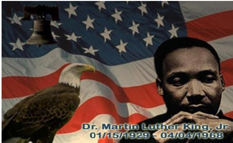
Dr. Martin Luther King, Jr. 01/15/1929 - 04/04/1968

Please note! City Hall will be closed all day on Monday, January 18th for Martin Luther King, Jr. Day.