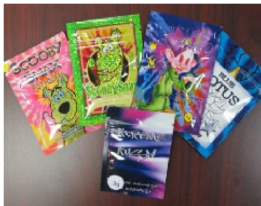
Photo Caption: Synthetic Drugs, such as Bath Salts and Synthetic Marijuana, are packaged to be attractive to kids/teens. Parents should be on the look-out for colorful packages, sometimes with cartoon characters on them that are labeled as things like "potpourri, plant food, or incense".

Information provided by Partners in Prevention www.pipnh.org and Stand Up Laconia www.standuplaconia.org