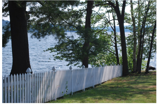
View of Lake Winnisquam at Gale Ave.