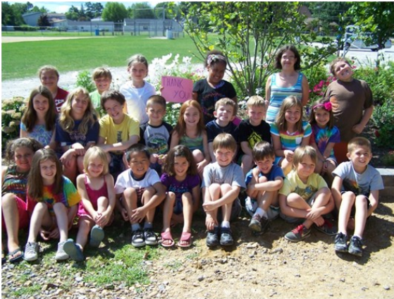
Some happy campers from last year!

It's that time of year again to sign your children up for camp! This is something you really want to think about before you just pick a camp. There are many in the area. You will want to make sure that the camp you choose suits your child's needs (academic, recreational, specialized). The Opechee Day Camp is a purely recreational camp and the children are playing all day, one way or another. We play organized sports, CATCH (Coordinated Approach to Child Health) games, swimming, field trips, playgrounds, arts & crafts, etc.