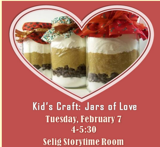
Kid's Craft: Jars of Love Tuesday, February 7 4-5:30 Selig Storytime Room