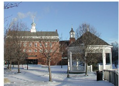
Belknap Mill Society