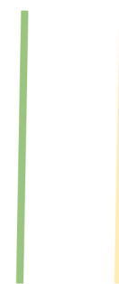
Percentage of Capacity